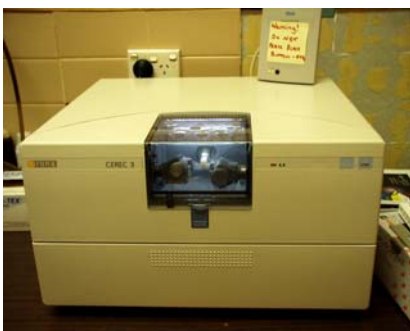
Milling the ceramic block