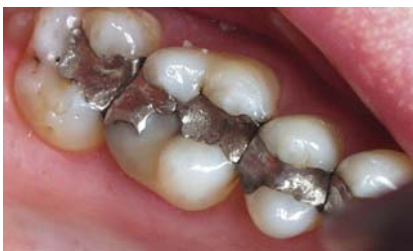
Old amalgam filling

What are the advantages of Cerec? Cerec allows us to produce biocompatible, non-metallic and natural looking ceramic restorations. These are of superior quality and durability than direct tooth coloured composite resin restorations. Cerec restorations are typically done in a single visit, hence only the one application of local anaesthetic. Often they can be more conservative of tooth structure and can avoid crowns in many cases. Their properties enable us to restore much of the original strength lost to the tooth during the decay process and subsequent filling. The ceramic, Vita Mark II blocks have a similar abrasion resistance and co-efficient of thermal expansion to enamel, hence it does not cause increased wear to opposing teeth or cause cracks due to flexing.