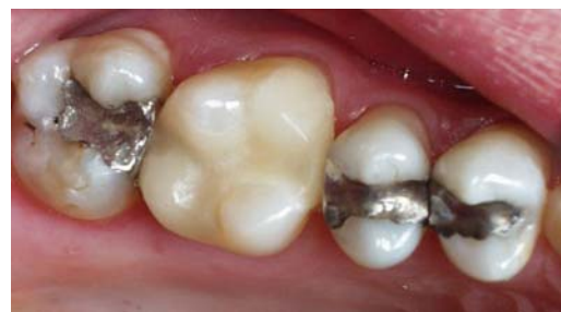
Final Cerec inlay